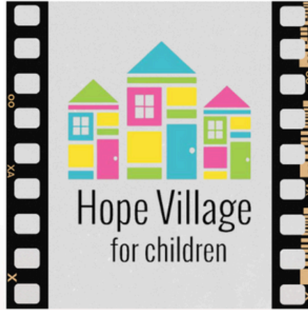
HOPE VILLAGE TBRI PRACTITIONERS