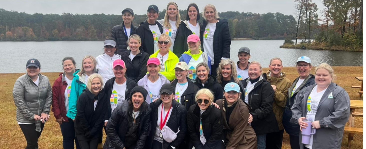
The Hope Village Guild at the 2023 Run for Hope '23