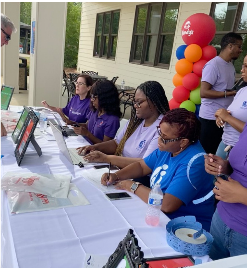
MS Families for Kids 23rd Annual Wendy's Children's Golf Classic